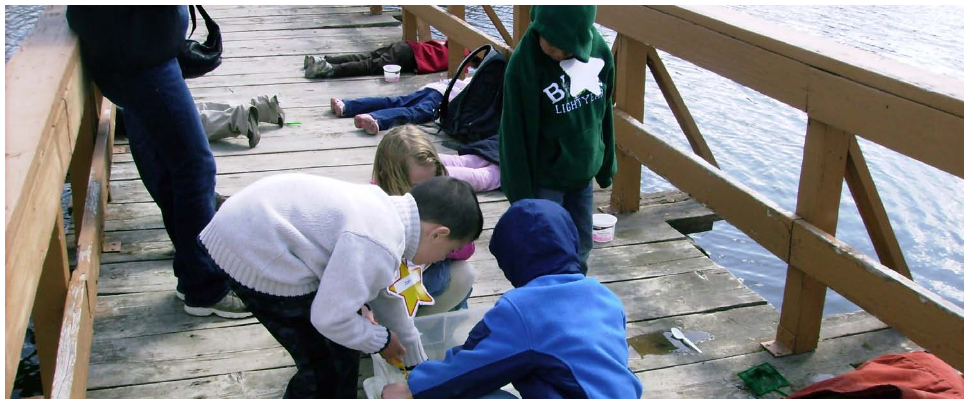
The Saskatoon Zoo Society's pond dipping program at the Saskatoon Forestry Farm Park Zoo.