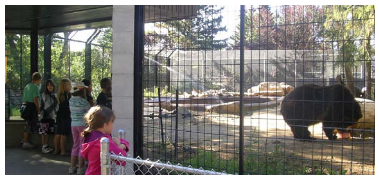
Home of Mistaya and Koda, the Brown Bears at the Saskatoon Forestry Farm Park Zoo.