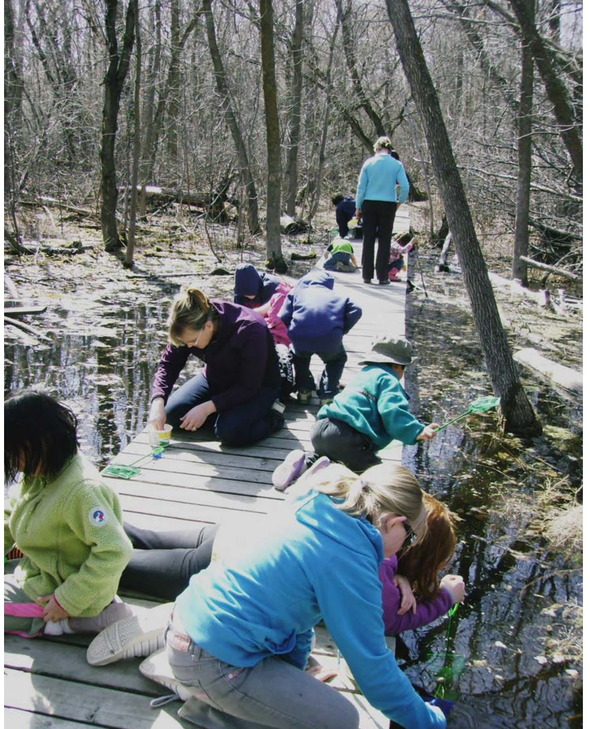
SASKATOON ZOO SOCIETY

The Saskatoon Zoo Society is a volunteer-driven, non-profit organization dedicated to fostering respect for nature through education. Each year, the dedicated staff and volunteers of the Saskatoon Zoo Society carry out over 350 education programs. The Saskatoon Zoo Society has been developing and delivering innovative environmental education programs for the citizens of Saskatchewan since 1974. Although we are not the Forestry Farm Park and Zoo, we work closely with the zoo to deliver high-quality, wildlife-based education programs to school groups and other interested parties. We are funded through grants, donations, cost-recovery on our programs, funds raised from the Paws Inn Concession and Gift Shop at the zoo, our membership program, our Adopt-a-Critter program and special fundraising events throughout the year.