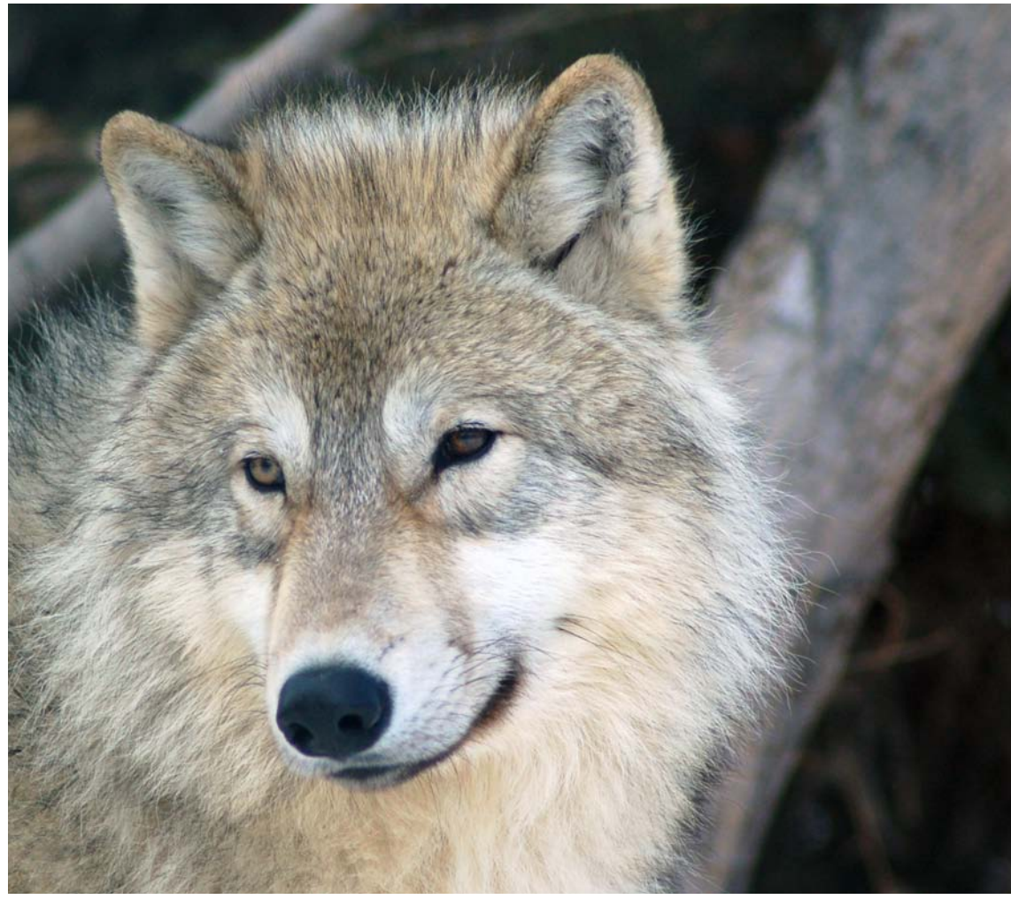
Buddy, the Grey Wolf.