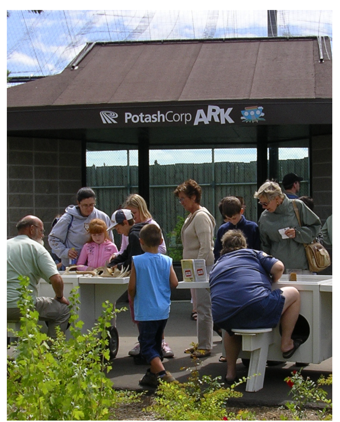
Volunteers with the Saskatoon Zoo Society at Investigation Stations in the Zoo.