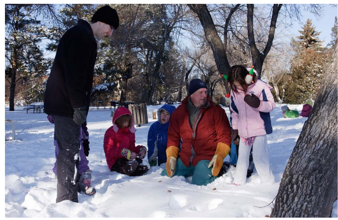
Young Naturalists' Tracking program.