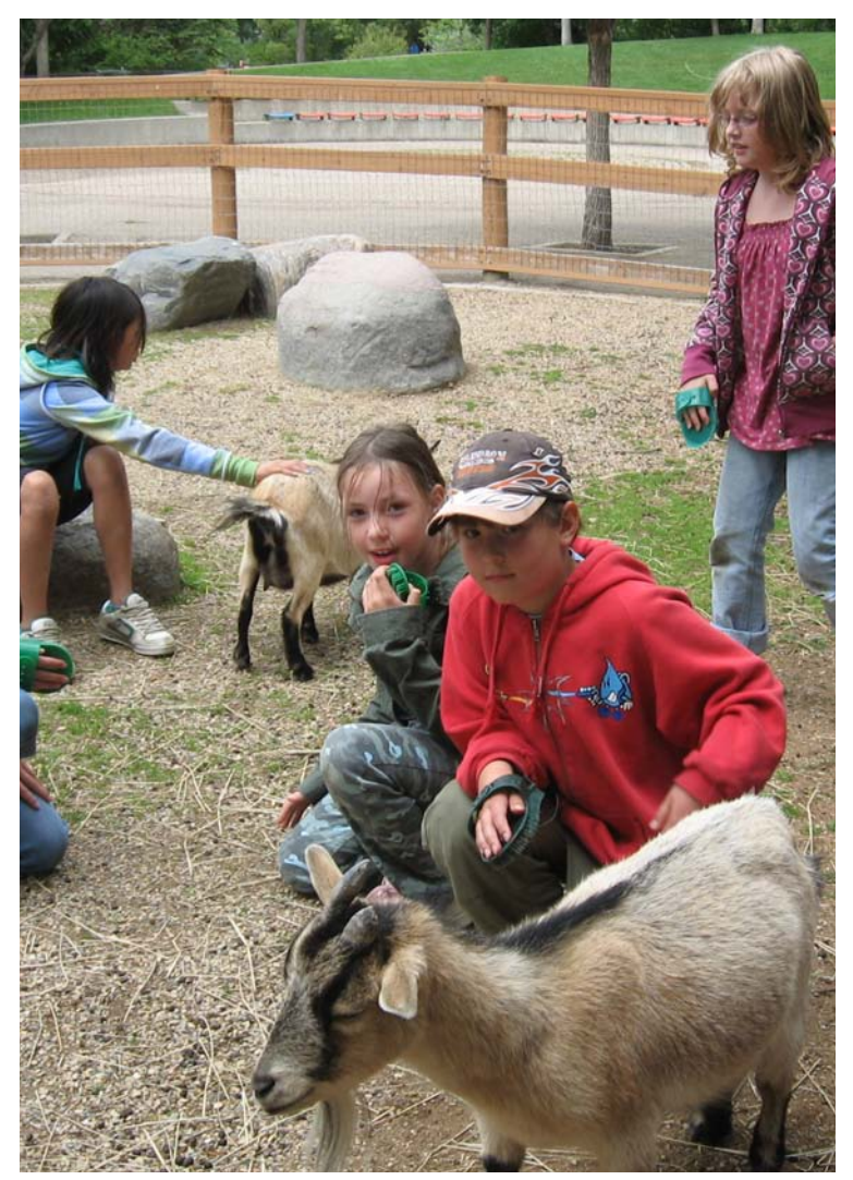
Bio-Bits zoo camp participants working with the Pygmy Goats.

The cost for these programs is $2,400. We receive about $500 in income from some of the programs. The sponsorship request on the Young Naturalists' Programs is $1,900 per year.